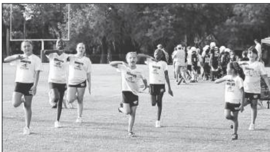
Right: The North Port Huskys cheerleaders root for the varsity football team during an away game against the Port Charlotte Bandits Saturday at the Franz Ross Park field.